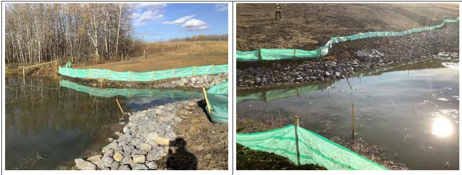
Photo 55 View east from WQ-05b sample site, located downslope of the SWCRR Project and Wetland 09. Photo taken during fall sampling on October 15, 2020.