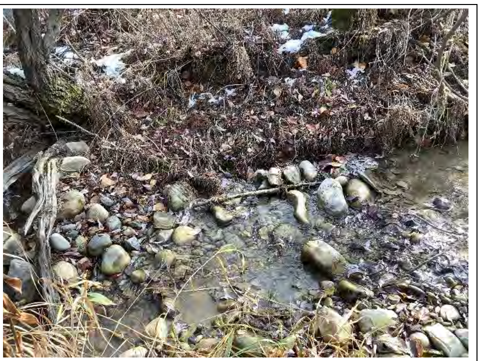
Photo 80 View of ground conditions at the FL-01 inflow site. Photo taken during fall sampling on October 15, 2020.