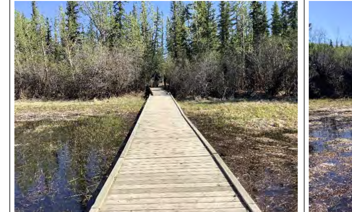
Photo 3View north from WQ-01 sample site, located within the Reference<br/>Wetland. Photo taken during spring sampling on May 28, 2020.