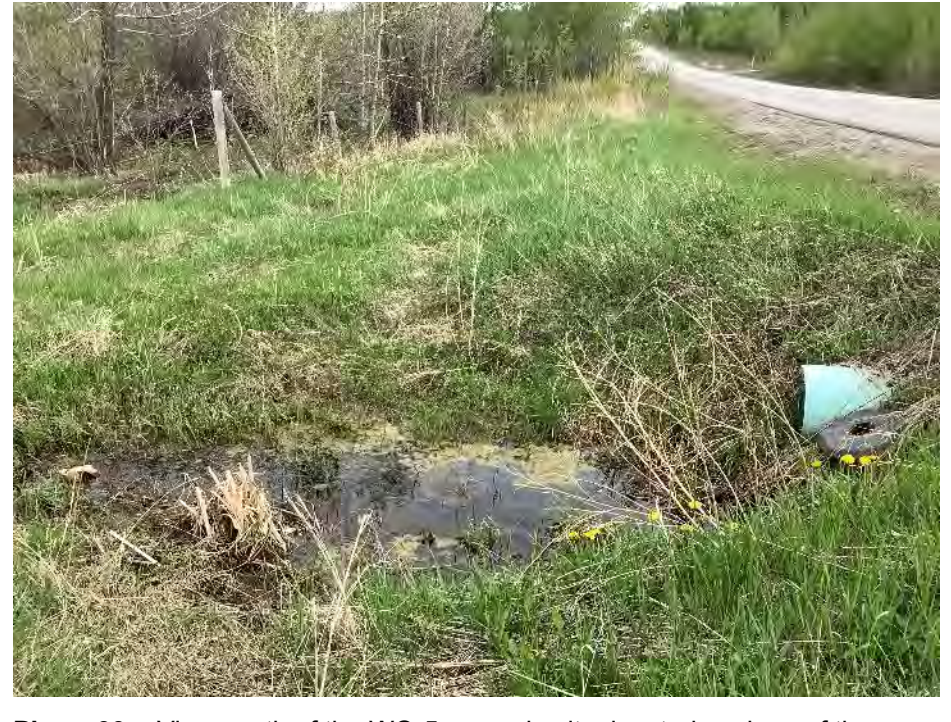
Photo 66 View south of the WQ-5a sample site, located upslope of the SWCRR Project within Wetland 09. Photo taken during spring sampling on May 28, 2020.