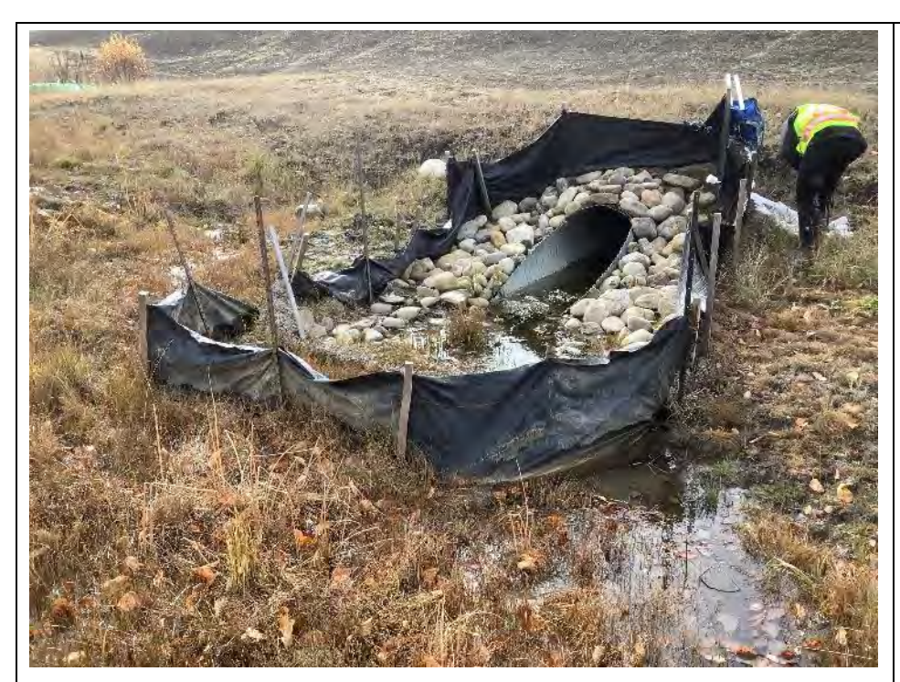
Photo 45 View southwest from WQ-04b sample site, located downslope of the SWCRR Project and Wetland 08. Photo taken during fall sampling on October 15, 2020.