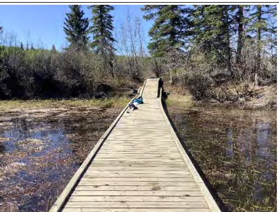
Photo 4View south from WQ-01 sample site, located within the Reference<br/>Wetland. Photo taken during fall sampling on May 28, 2020.