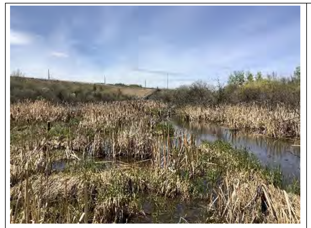
Photo 9View east from WQ-02 sample site, located within Wetland 06.Photo taken during spring sampling on May 28, 2020.