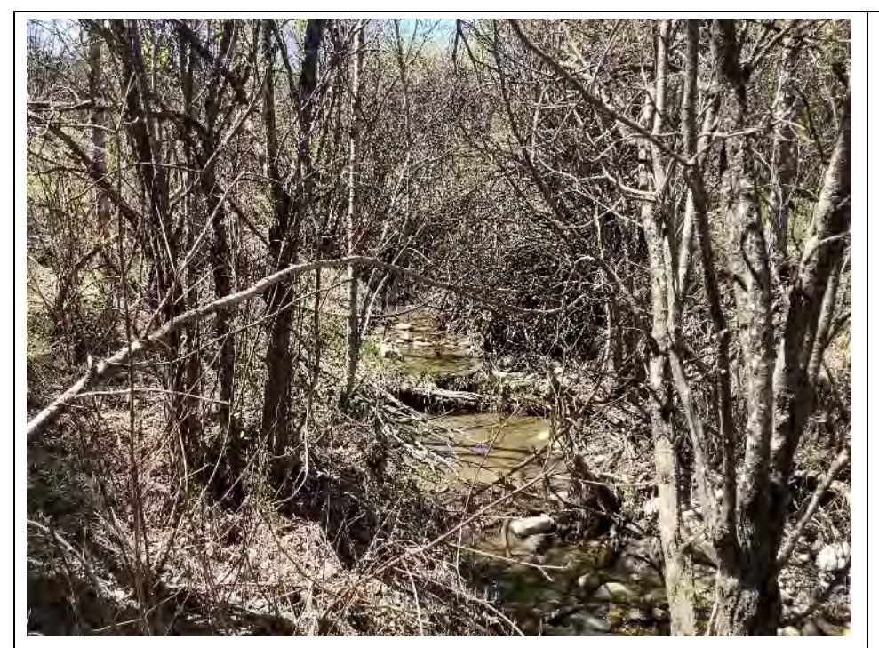
Photo 73 View upstream (southwest) of the FL-01 inflow site. Photo taken during spring sampling on May 28, 2020.