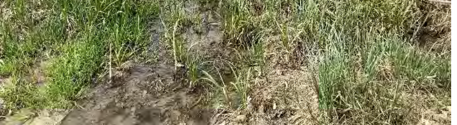
Photo 42 View north from WQ-04b sample site, located downslope of the SWCRR Project and Wetland 08. Photo taken during spring sampling on May 28, 2020.

Photo 41 View southwest from WQ-04b sample site, located downslope of the SWCRR Project and Wetland 08. Photo taken during spring sampling on May 28, 2020.