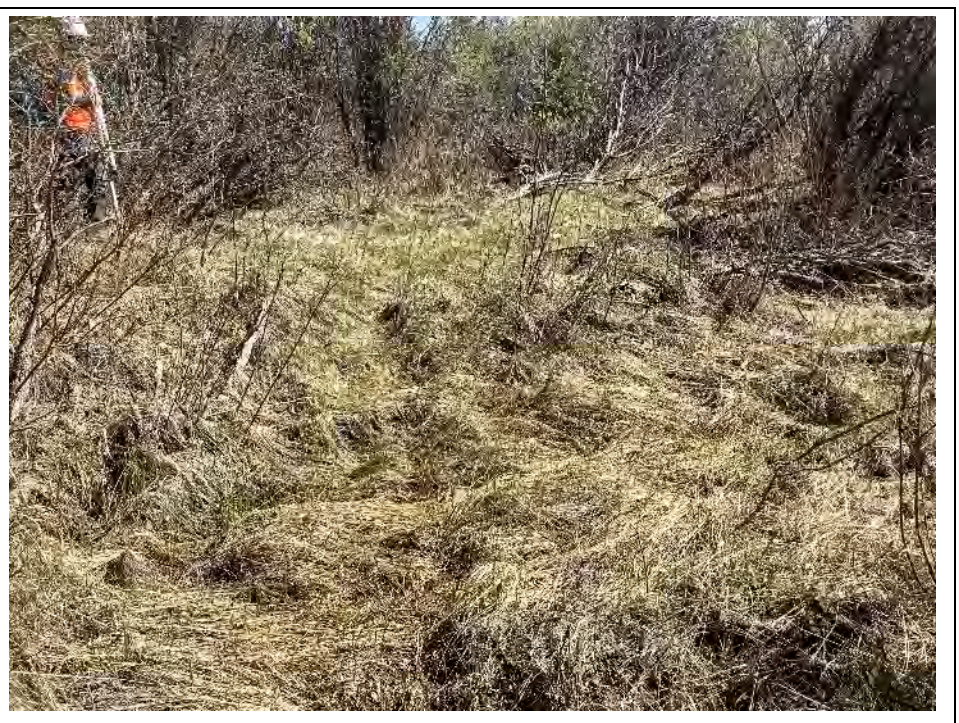
Photo 92 View of ground conditions at the dry FL-03 Inflow site. Photo taken during spring sampling on May 28, 2020.