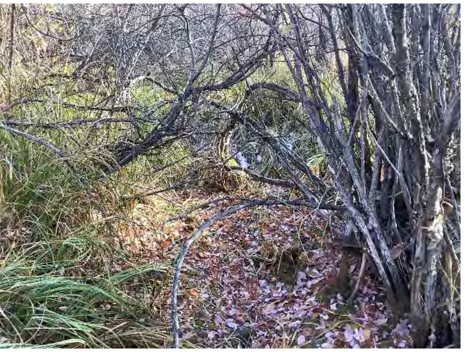
Photo 94 View northeast of the FL-03 Inflow site. Photo taken during fall sampling on October 15, 2020.