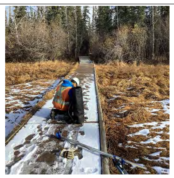
Photo 7 View north from WQ-01 sample site, located within the Reference Wetland. Photo taken on October 15, 2020.