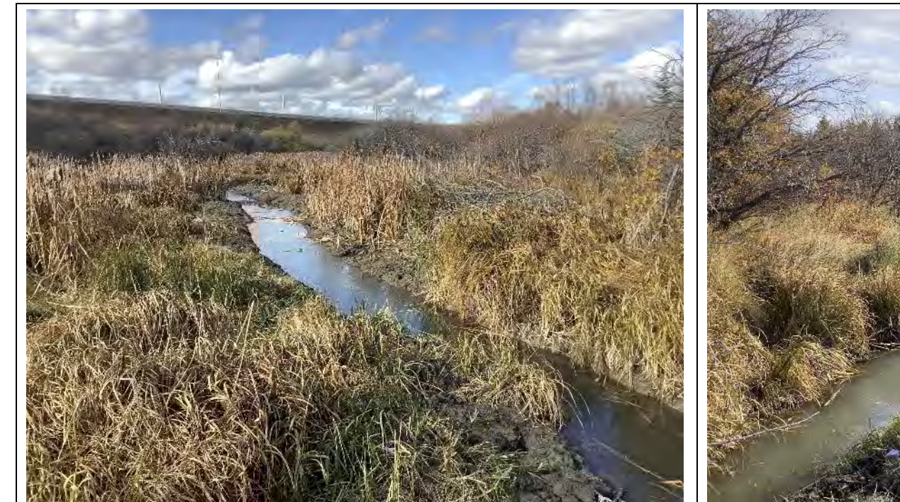
Photo 13 View east from WQ-02 sample site, located within Wetland 06. Photo taken during fall sampling on October 15, 2020.