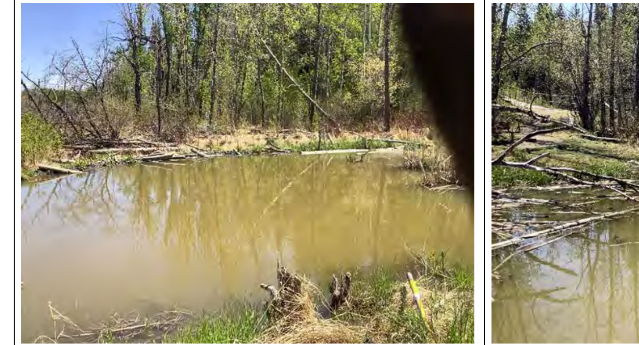
Photo 19View north from WQ-03 sample site, located within Wetland 06.Photo taken during spring sampling on May 28, 2020.