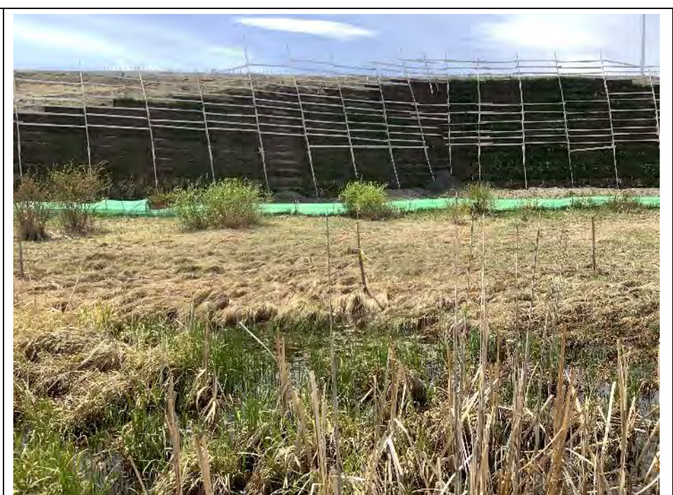
Photo 35 View northeast from WQ-07 sample site, located downslope of the SWCRR Project and Wetland 08. Photo taken during spring sampling on May 28, 2020.

Photo 36 View west from WQ-07 sample site, located downslope of the SWCRR Project and Wetland 08. Photo taken during spring sampling on May 28, 2020.