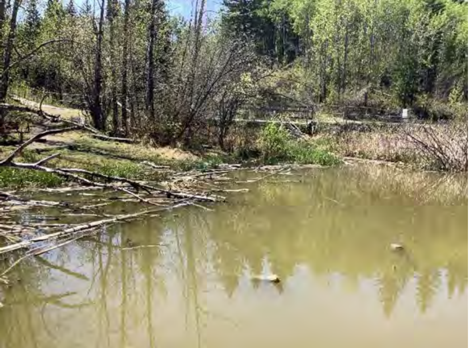
Photo 20 View south from WQ-03 sample site, located within Wetland 06. Photo taken during spring sampling on May 28, 2020.