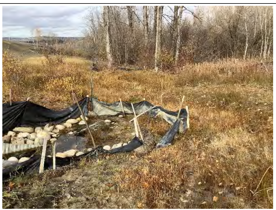
Photo 46 View north from WQ-04b sample site, located downslope of the SWCRR Project and Wetland 08. Photo taken during fall sampling on October 15, 2020.