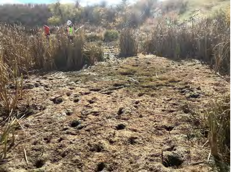
Photo 38 View south from the dry WQ-07 sample site, located downslope of the SWCRR Project and Wetland 08. Photo taken during fall sampling on October 15, 2020.