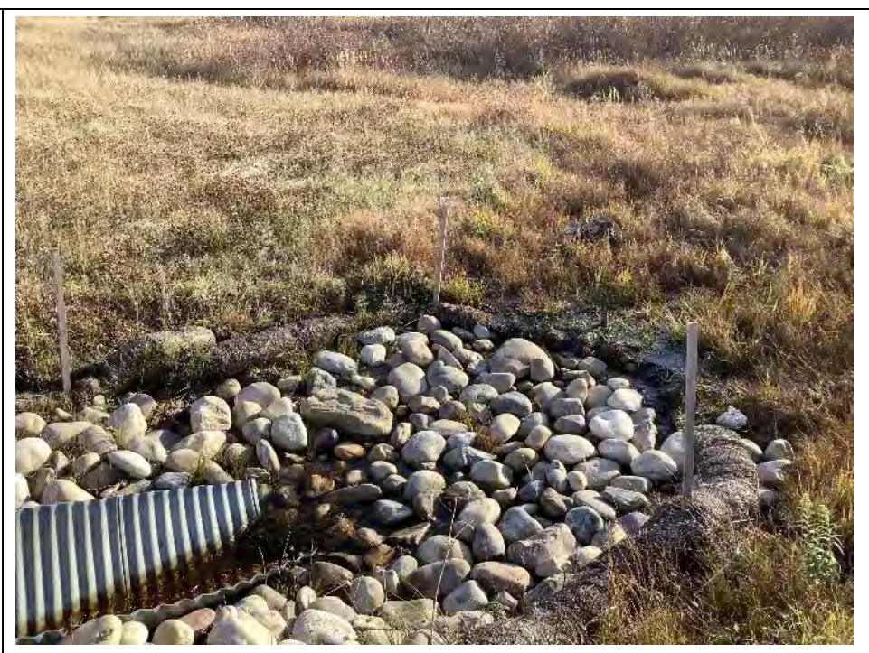
Photo 64 View southwest from WQ-4a sample site, located upslope of the SWCRR Project within Wetland 08. Photo taken during fall sampling on October 15, 2020.