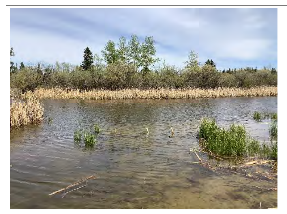
Photo 27 View east from WQ-06 sample site, located downslope of the SWCRR Project and Wetland 08. Photo taken during spring sampling on May 28, 2020.