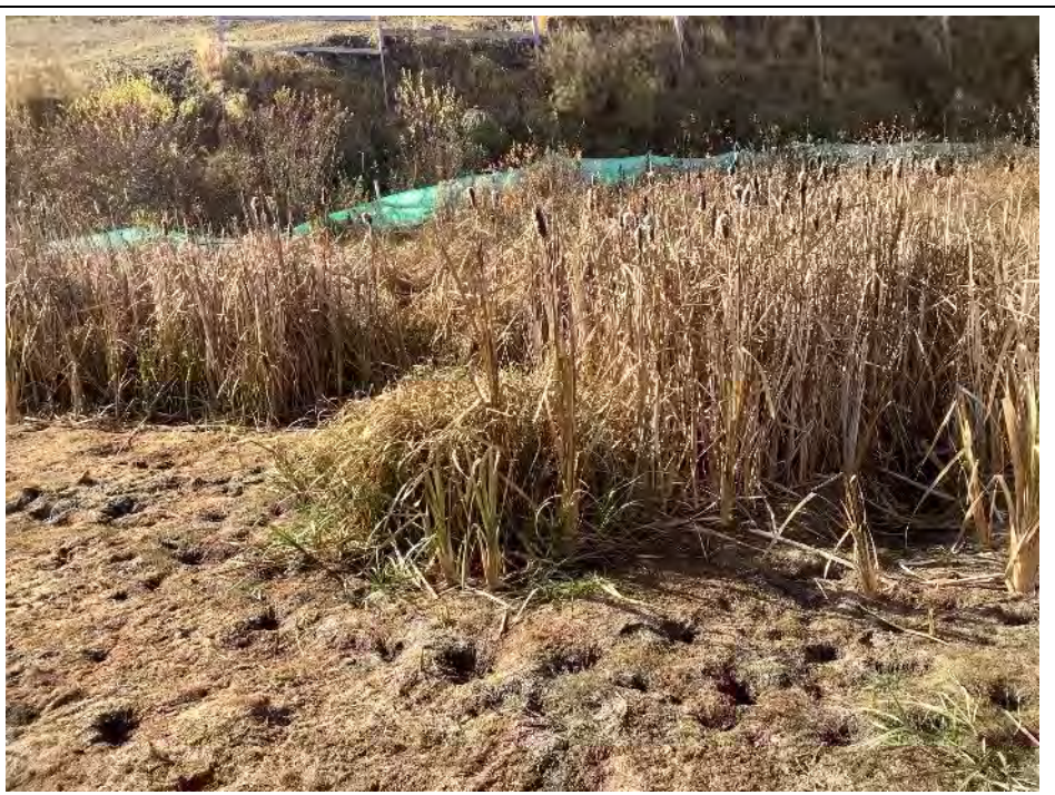
Photo 40 View west from the dry WQ-07 sample site, located downslope of the SWCRR Project and Wetland 08. Photo taken during fall sampling on October 15, 2020.