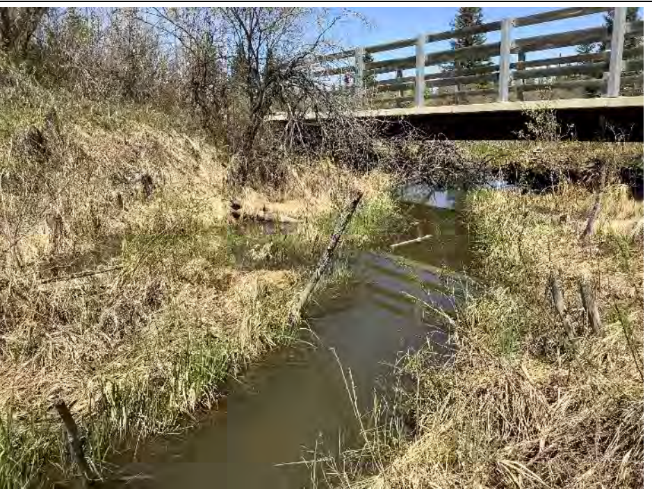
Photo 82 View downstream (north) of the FL-02 Inflow site. Photo taken during spring sampling on May 28, 2020.