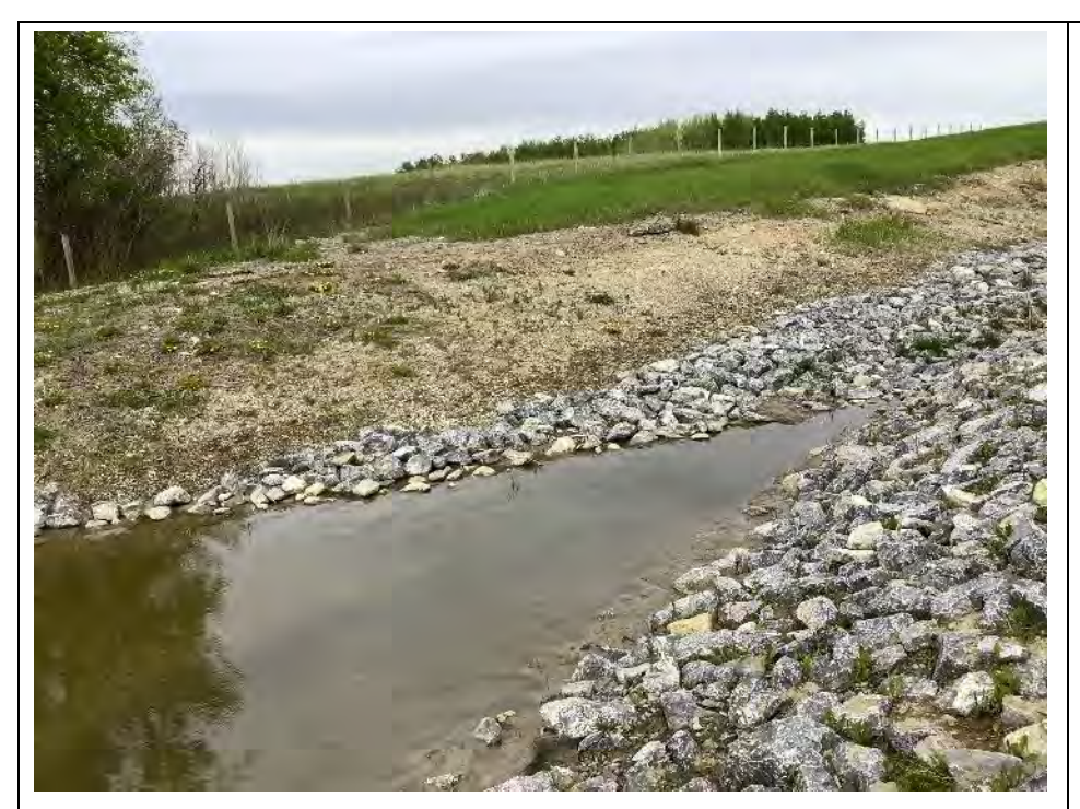
Photo 51View east from WQ-05b sample site, located downslope of the<br/>SWCRR Project and Wetland 09. Photo taken during spring<br/>sampling on May 28, 2020.