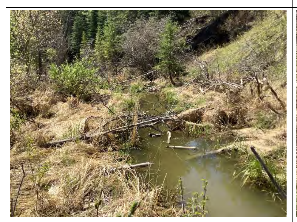
Photo 81View upstream (south) of the FL-02 Inflow site. Photo taken during<br/>spring sampling on May 28, 2020.