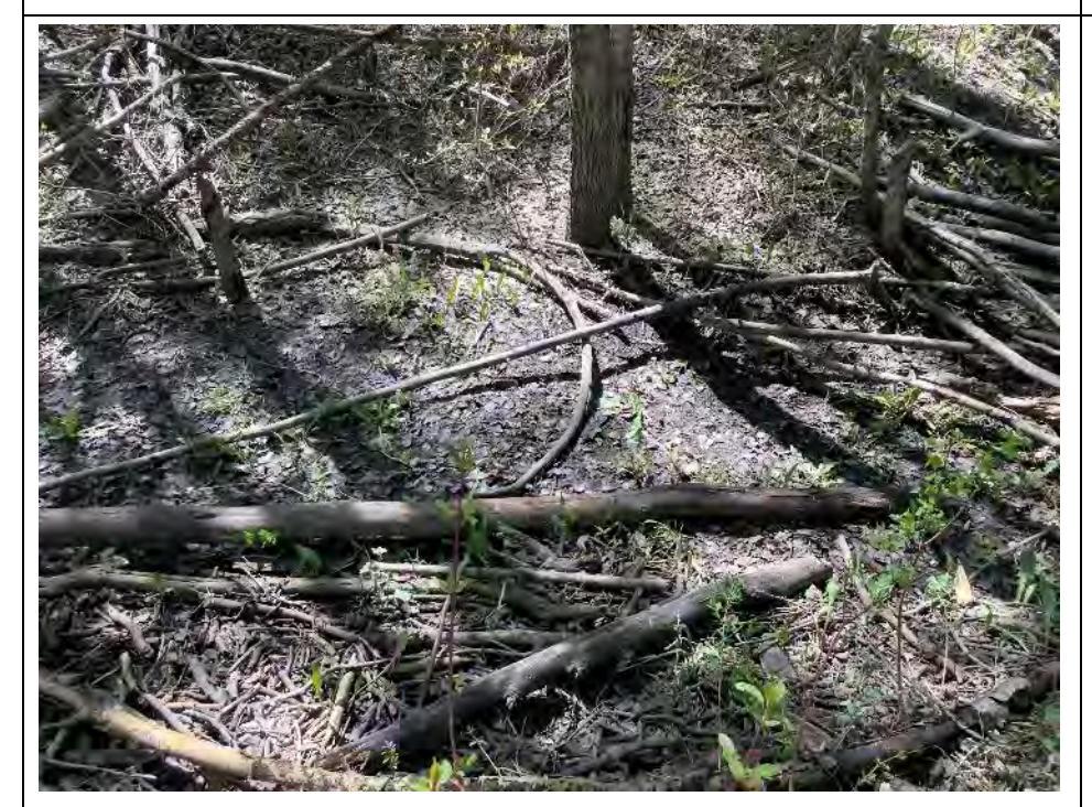
View of ground conditions at the dry FL-04 outflow site. Photo taken during spring sampling on May 28, 2020. Photo 99