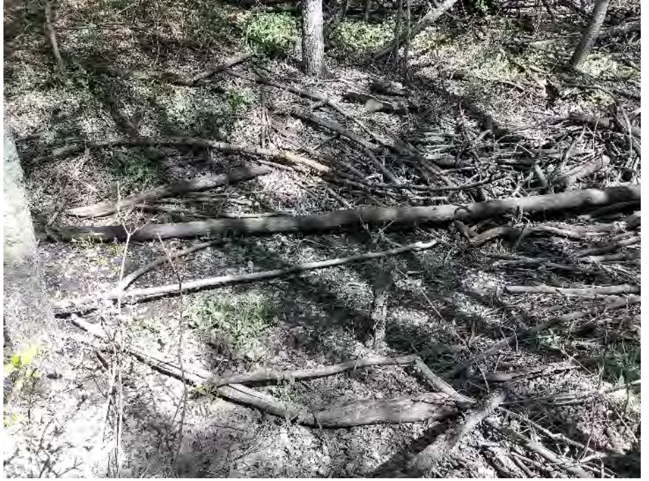
Photo 100 View of ground conditions at the dry FL-04 outflow site. Photo taken during spring sampling on May 28, 2020.