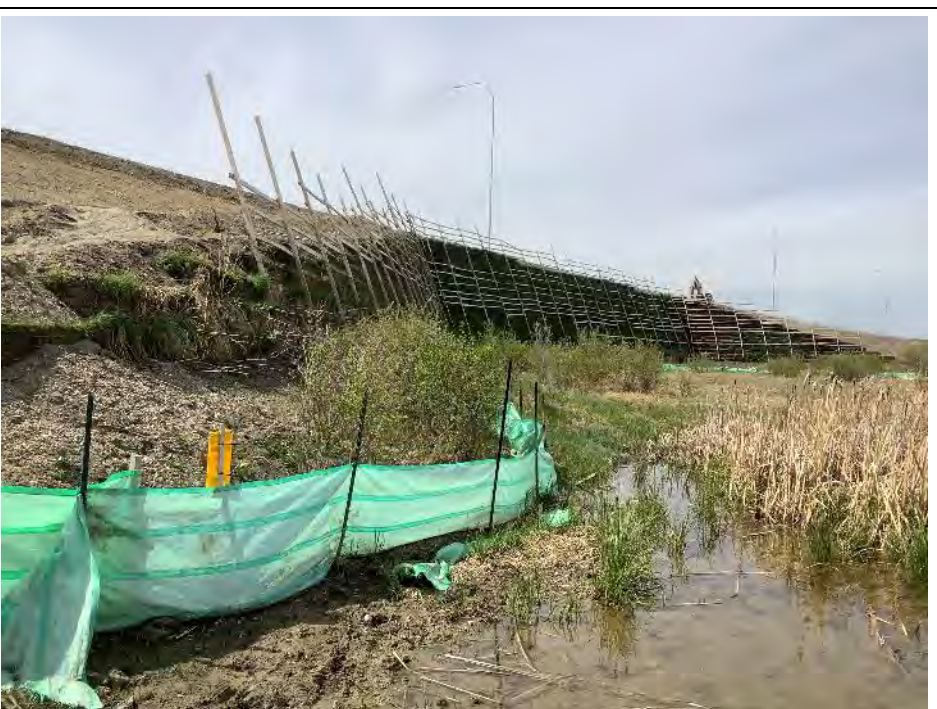
Photo 28 View northwest from WQ-06 sample site, located downslope of the SWCRR Project and Wetland 08. Photo taken during spring sampling on May 28, 2020.