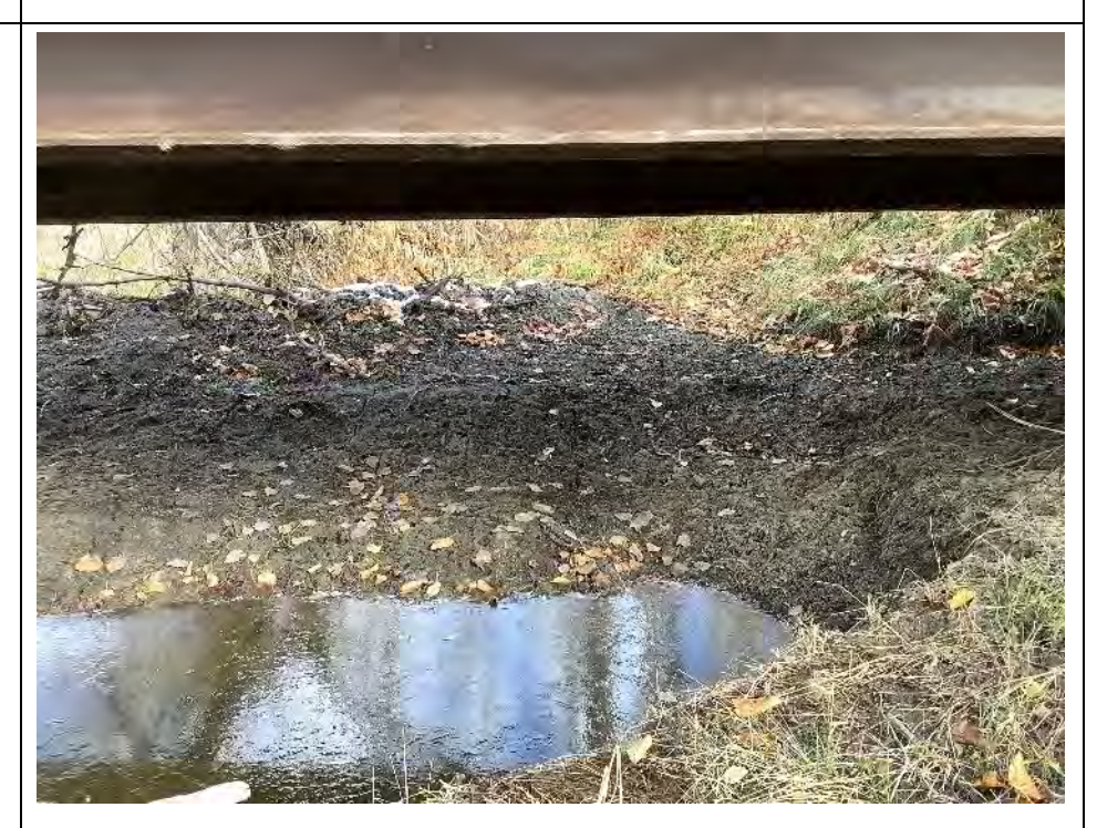
Photo 88 View downstream (north) of the FL-02 Inflow site. A beaver dam located at the downstream extent of the inflow channel prevents surface connectivity between the Channel and Wetland 06. Photo taken during fall sampling on October 15, 2020.