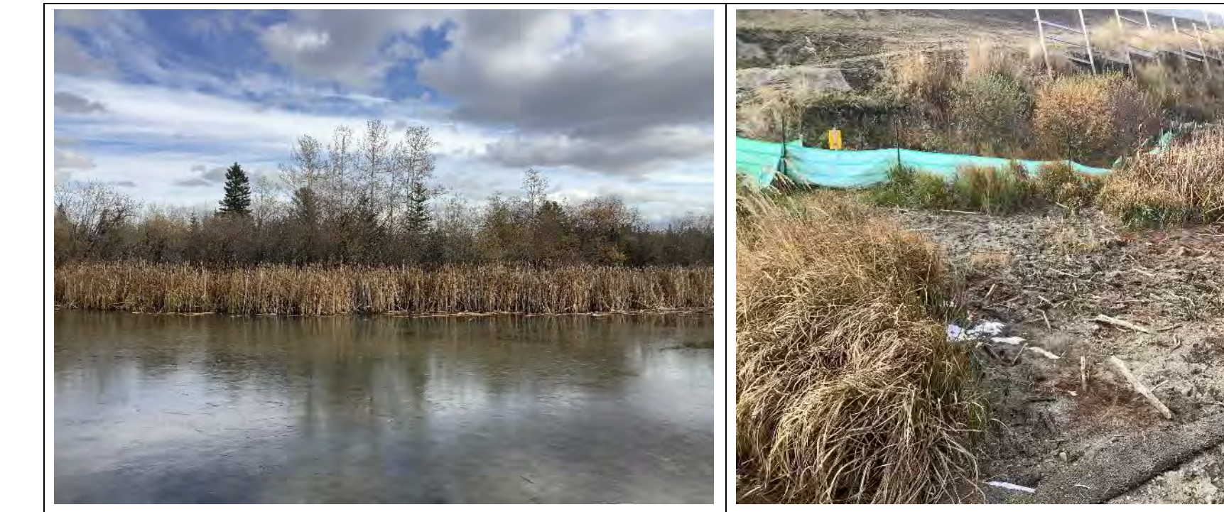
Photo 31 View east from WQ-06 sample site, located downslope of the SWCRR Project and Wetland 08. Photo taken during fall sampling on October 15, 2020.