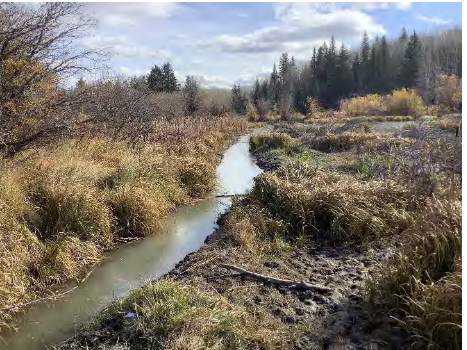
View west from WQ-02 sample site, located within Wetland 06. Photo taken during fall sampling on October 15, 2020. Photo 14