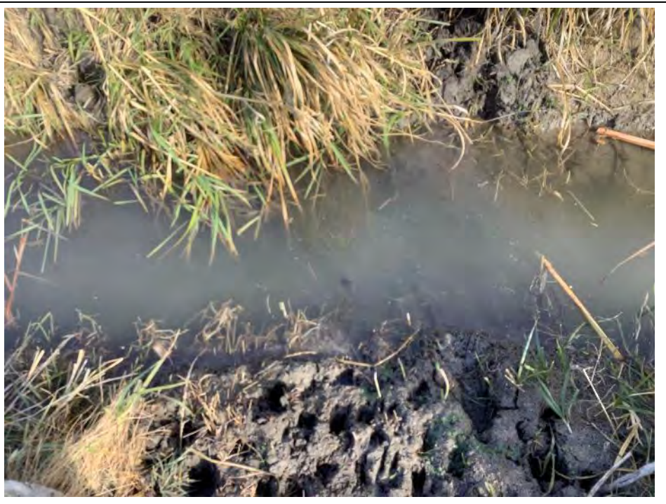
Photo 16 View of ground conditions from WQ-02 sample site, located within Wetland 06. Photo taken during fall sampling on October 15, 2020.