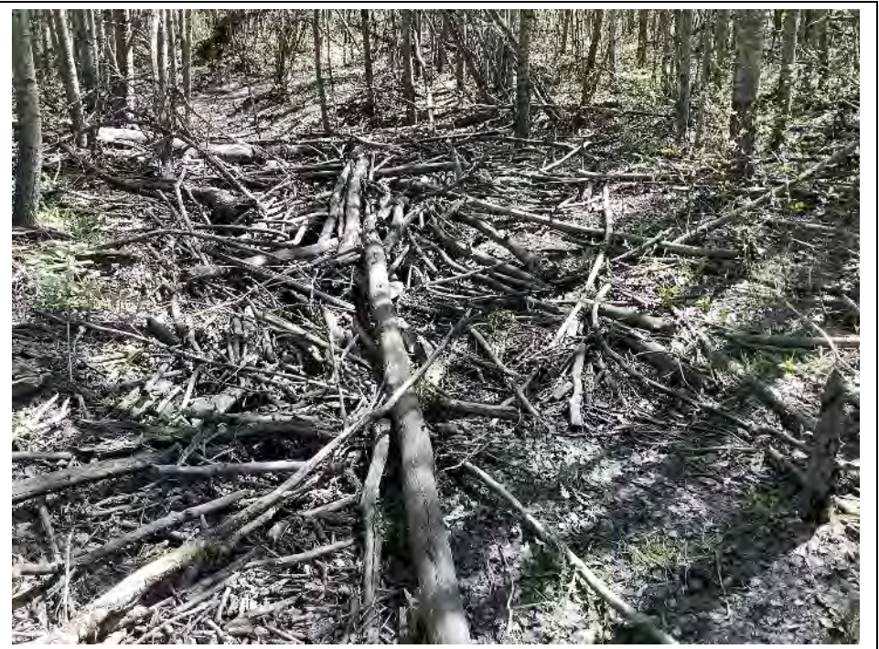
View northeast of the FL-04 outflow site. Photo taken during spring sampling on May 28, 2020. Photo 98