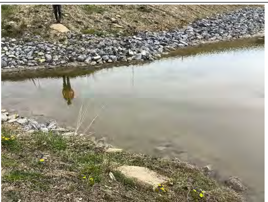
Photo 52 View south from WQ-05b sample site, located downslope of the SWCRR Project and Wetland 09. Photo taken during spring sampling on May 28, 2020.