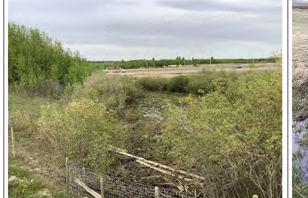
Photo 57 View east upstream of the WQ-4a sample site, located upslope of the SWCRR Project within Wetland 08. Photo taken during spring sampling on May 28, 2020.