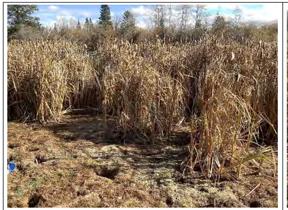
Photo 37 View southeast from the dry WQ-07 sample site, located downslope of the SWCRR Project and Wetland 08. Photo taken during fall sampling on October 15, 2020.