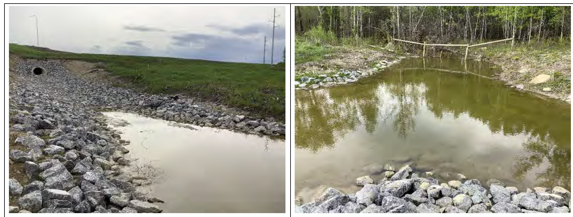
Photo 49 View northwest from WQ-05b sample site, located downslope of the SWCRR Project and Wetland 09. Photo taken during spring sampling on May 28, 2020.