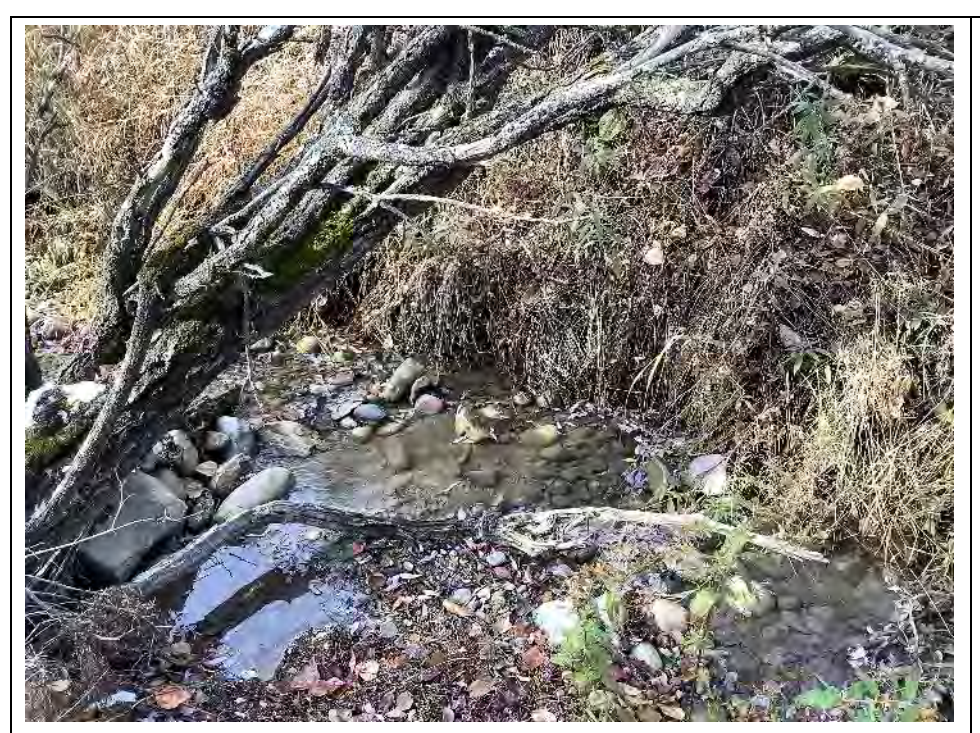
Photo 79 View of ground conditions at the FL-01 inflow site. Photo taken during fall sampling on October 15, 2020.