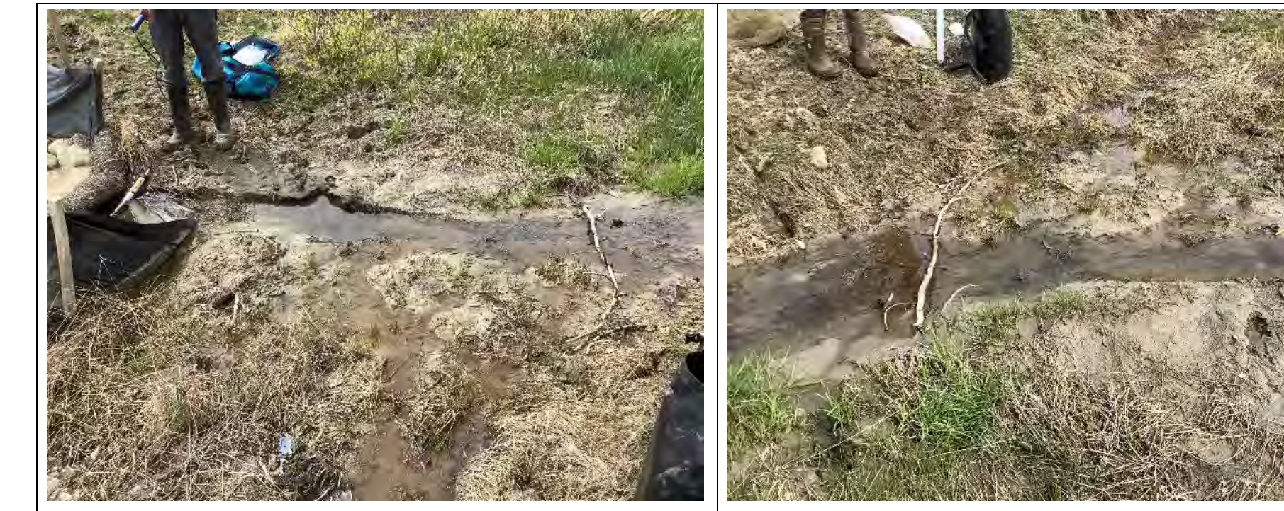
Photo 43 View west from WQ-04b sample site, located downslope of the SWCRR Project and Wetland 08. Photo taken during spring sampling on May 28, 2020.