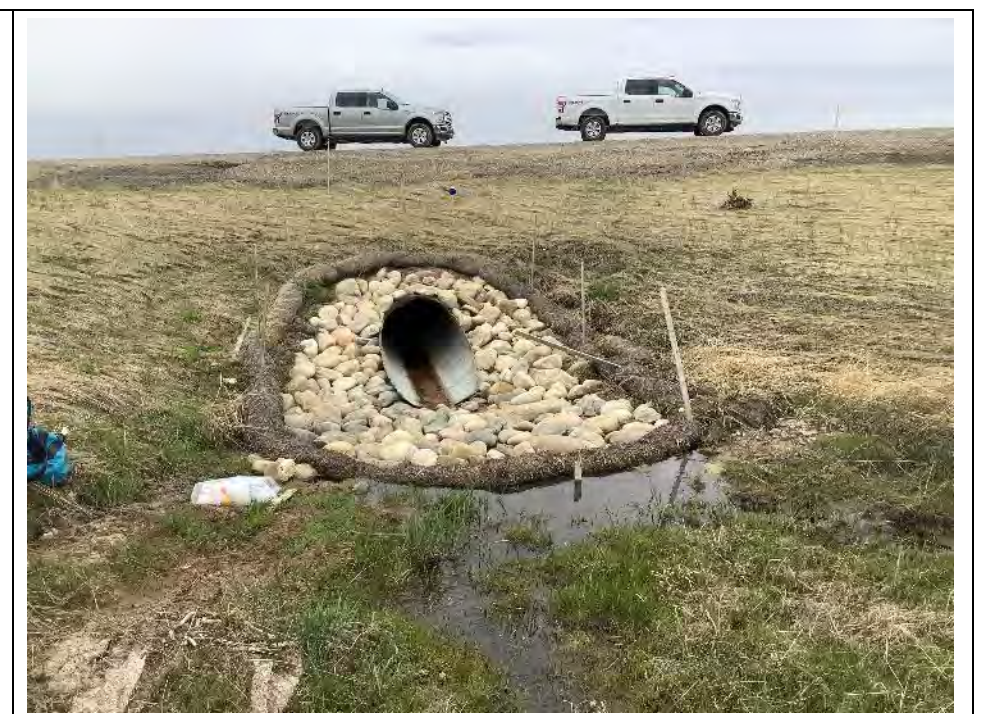
Photo 59 View west from WQ-4a sample site, located upslope of the SWCRR Project within Wetland 08. Photo taken during spring sampling on May 28, 2020.

Photo 60 View east from WQ-4a sample site, located upslope of the SWCRR Project within Wetland 08. Photo taken during spring sampling on May 28, 2020.