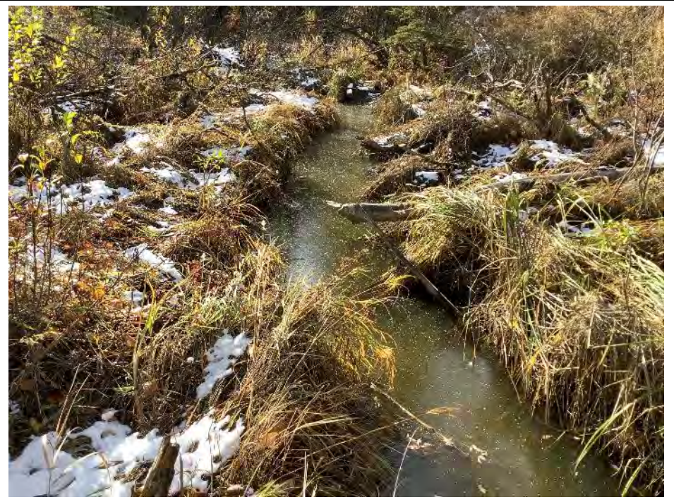
Photo 85 View upstream (south) of the FL-02 Inflow site. Photo taken during fall sampling on October 15, 2020.