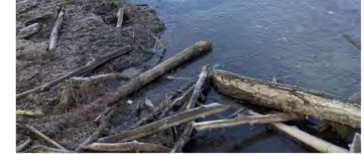
Photo 24 View northeast from WQ-03 sample site, located within Wetland 06. Photo taken during fall sampling on October 15, 2020.

Photo 23 View north from WQ-03 sample site, located within Wetland 06. Photo taken during fall sampling on October 15, 2020.