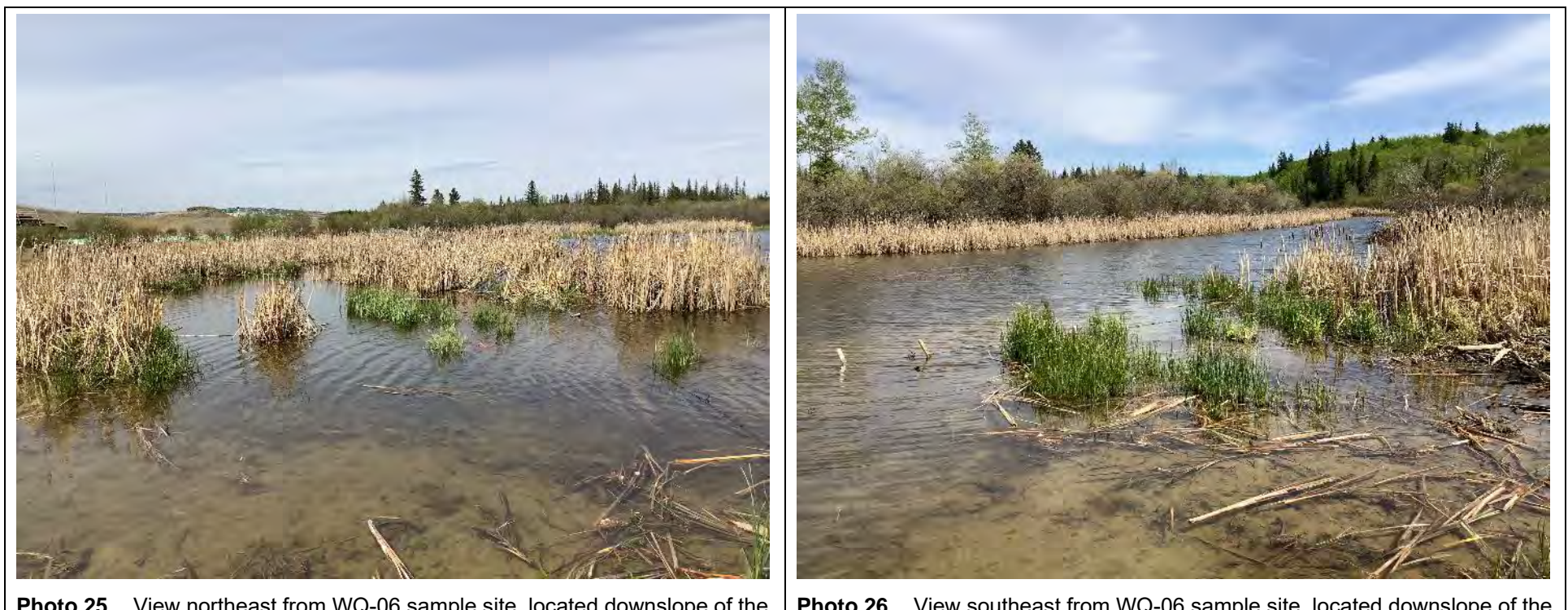
Photo 25 View northeast from WQ-06 sample site, located downslope of the SWCRR Project and Wetland 08. Photo taken during spring sampling on May 28, 2020.