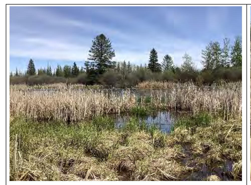
Photo 33 View east from WQ-07 sample site, located downslope of the SWCRR Project and Wetland 08. Photo taken during spring sampling on May 28, 2020.