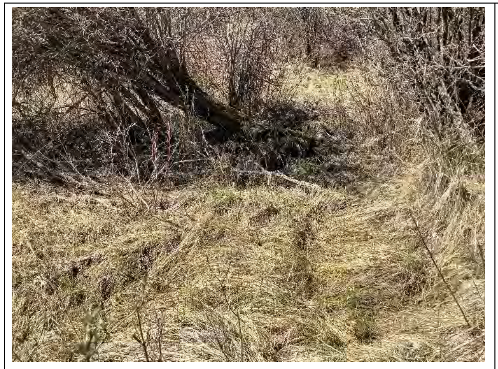
Photo 91View of ground conditions at the dry FL-03 Inflow site. Photo taken<br/>during spring sampling on May 28, 2020.