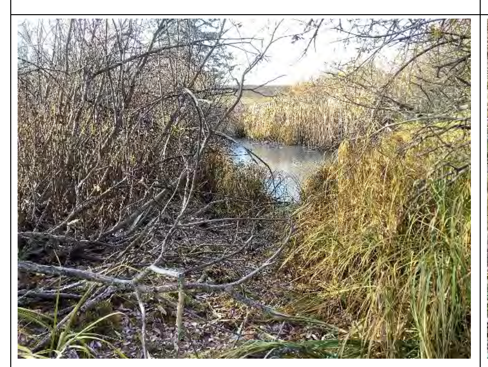
Photo 93 View southwest of the FL-03 Inflow site. Photo taken during fall sampling on October 15, 2020.