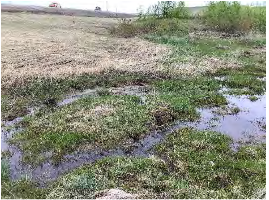
Photo 58 View south from WQ-4a sample site, located upslope of the SWCRR Project within Wetland 08. Photo taken during spring sampling on May 28, 2020.