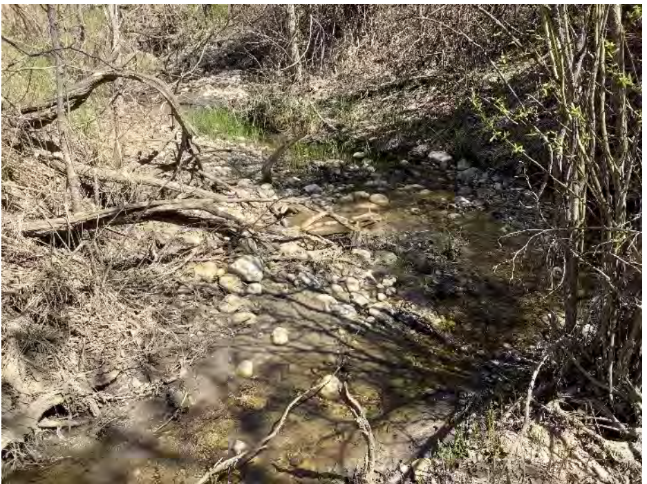
Photo 74 View downstream (northeast) of the FL-01 inflow site. Photo taken during spring sampling on May 28, 2020.