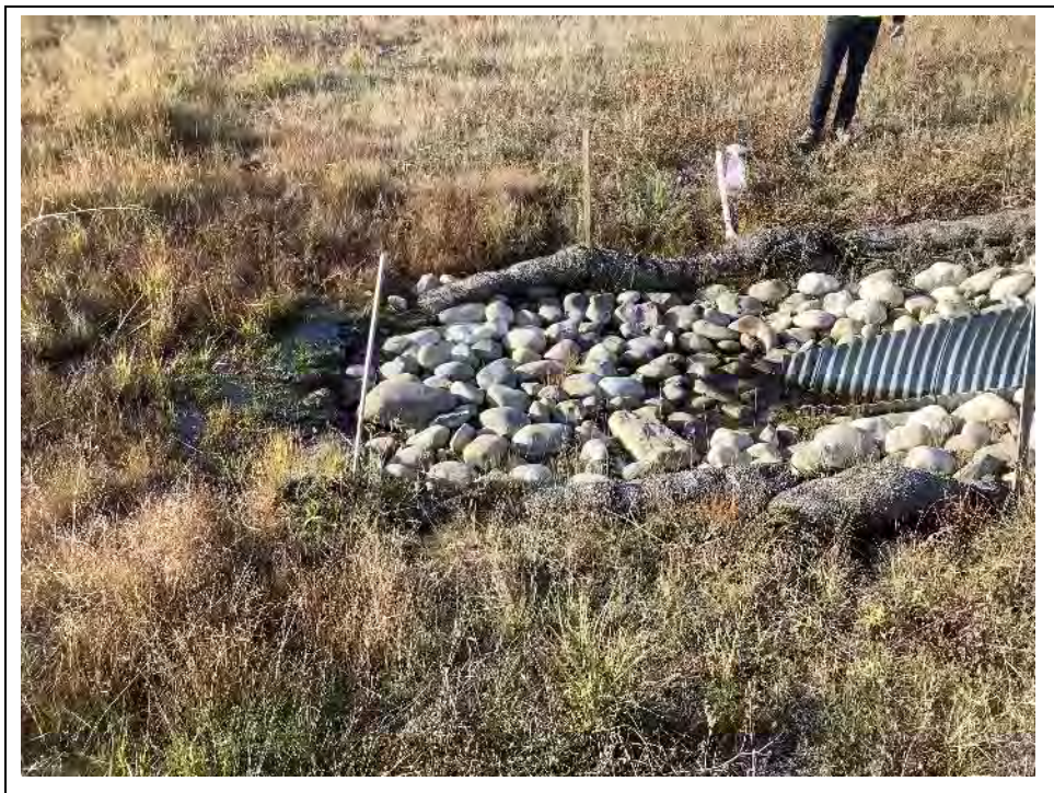
Photo 63 View south from WQ-4a sample site, located upslope of the SWCRR Project within Wetland 08. Photo taken during fall sampling on October 15, 2020.