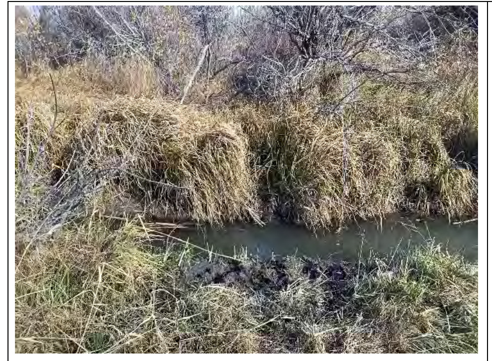
Photo 15 View north from WQ-02 sample site, located within Wetland 06. Photo taken during fall sampling on October 15, 2020.