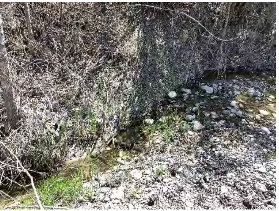
Photo 76 View of ground conditions at the FL-01 inflow site. Photo taken during spring sampling on May 28, 2020.