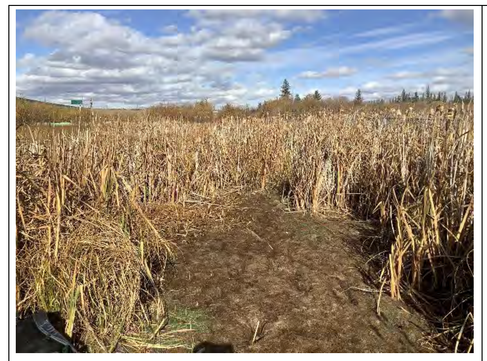
Photo 39 View north from the dry WQ-07 sample site, located downslope of the SWCRR Project and Wetland 08. Photo taken during fall sampling on October 15, 2020.