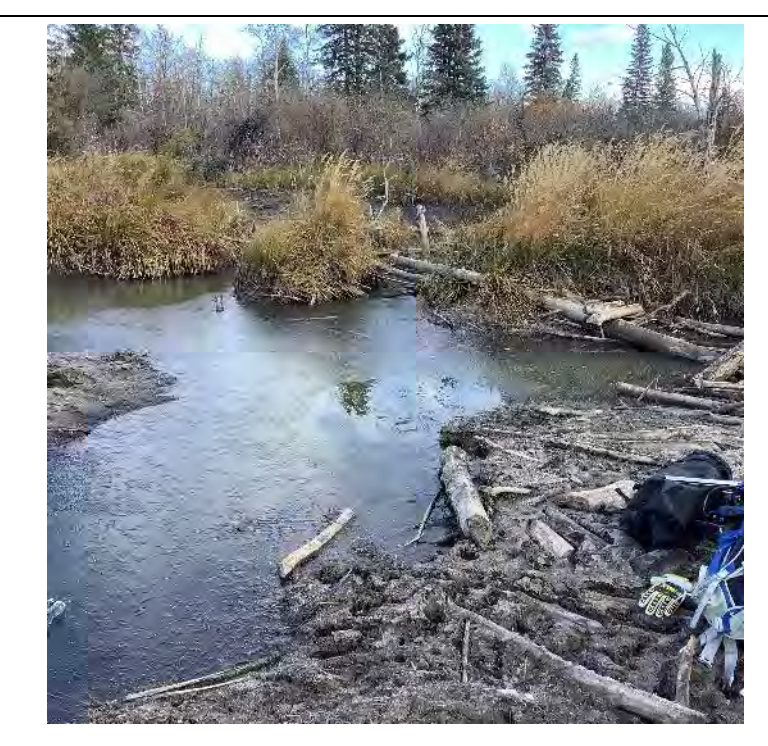
Photo 22 View west from WQ-03 sample site, located within Wetland 06. Photo taken during fall sampling on October 15, 2020.