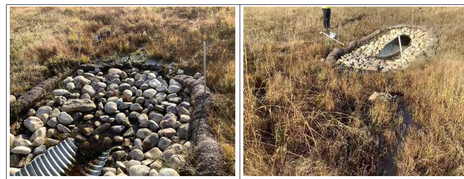
Photo 61 View west from WQ-4a sample site, located upslope of the SWCRR Project within Wetland 08. Photo taken during fall sampling on October 15, 2020.