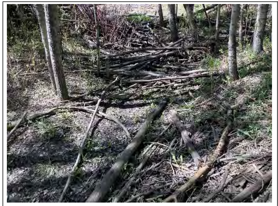
View southwest of the FL-04 outflow site. Photo taken during spring sampling on May 28, 2020. Photo 97