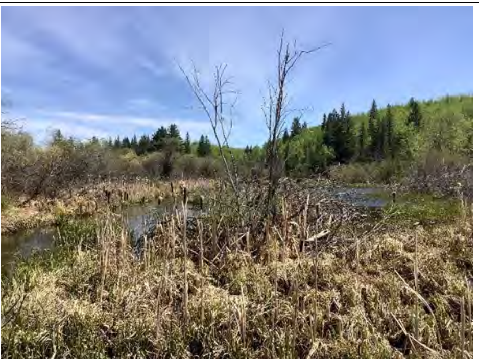
Photo 10View west from WQ-02 sample site, located within Wetland 06.Photo taken during spring sampling on May 28, 2020.