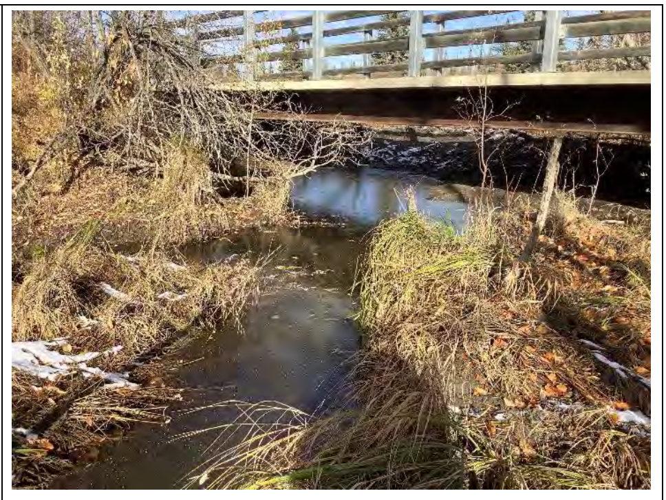
Photo 86 View downstream (north) of the FL-02 Inflow site. Photo taken during fall sampling on October 15, 2020.