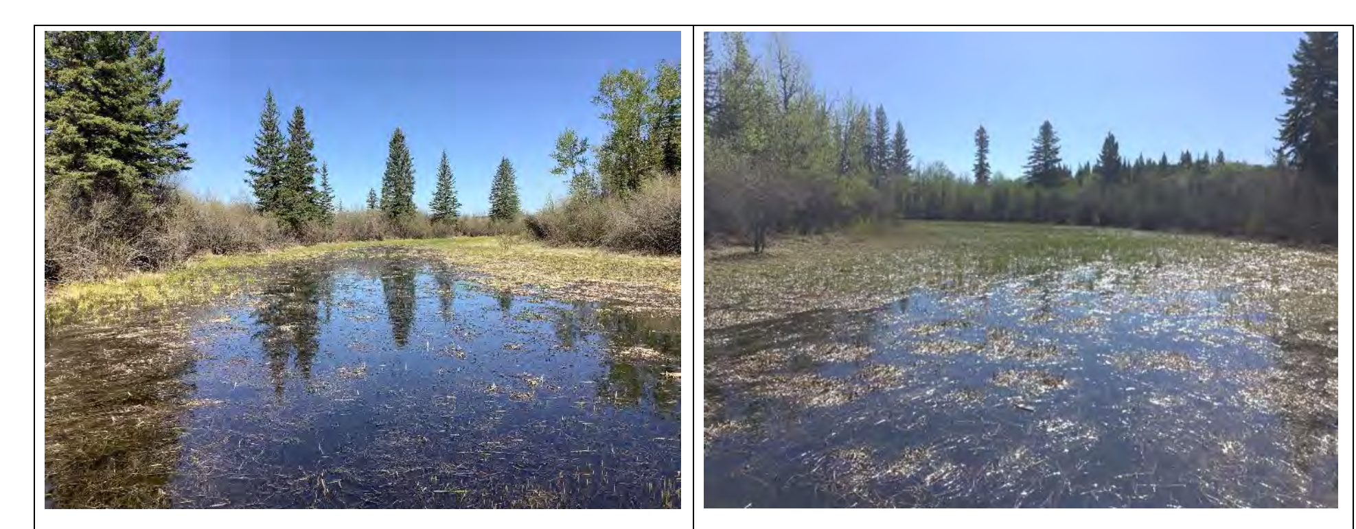
Photo 1View east from WQ-01 sample site, located within the Reference<br/>Wetland. Photo taken on May 28, 2020.