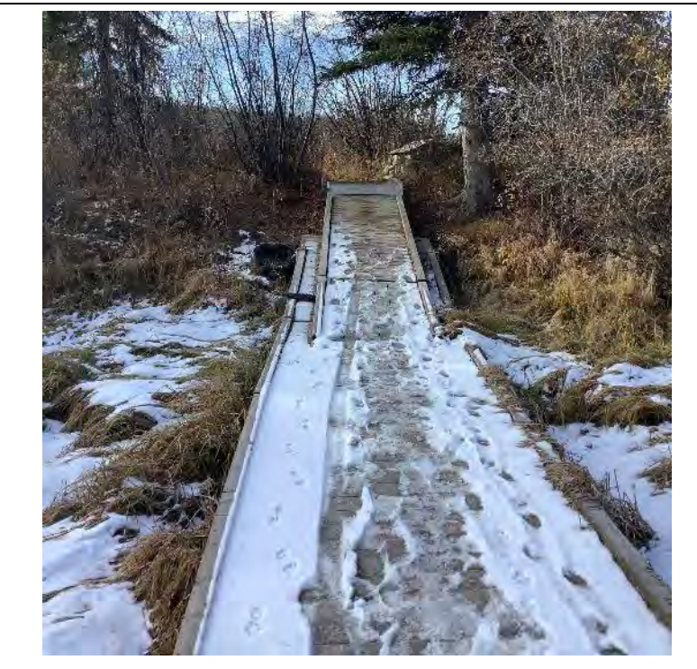
Photo 8 View south from WQ-01 sample site, located within the Reference Wetland. Photo taken on October 15, 2020.