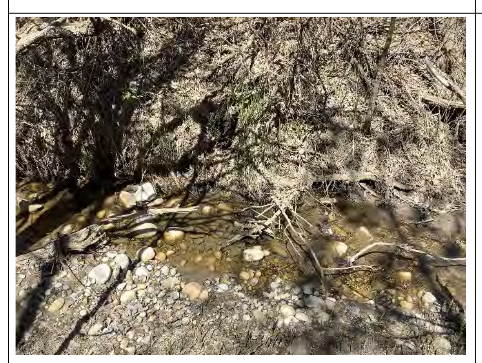
Photo 75 View of ground conditions at the FL-01 inflow site. Photo taken during spring sampling on May 28, 2020.