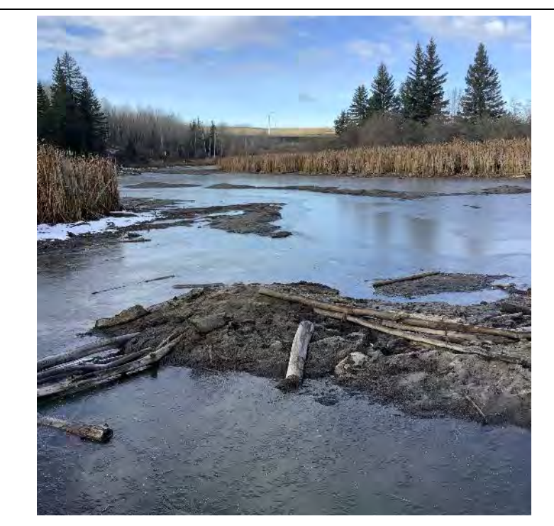
Photo 21 View east from WQ-03 sample site, located within Wetland 06. Photo taken during fall sampling on October 15, 2020.