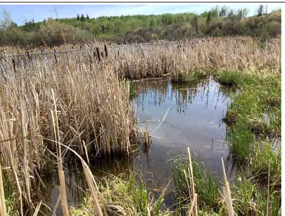
Photo 34 View southeast from WQ-07 sample site, located downslope of the SWCRR Project and Wetland 08. Photo taken during spring sampling on May 28, 2020.