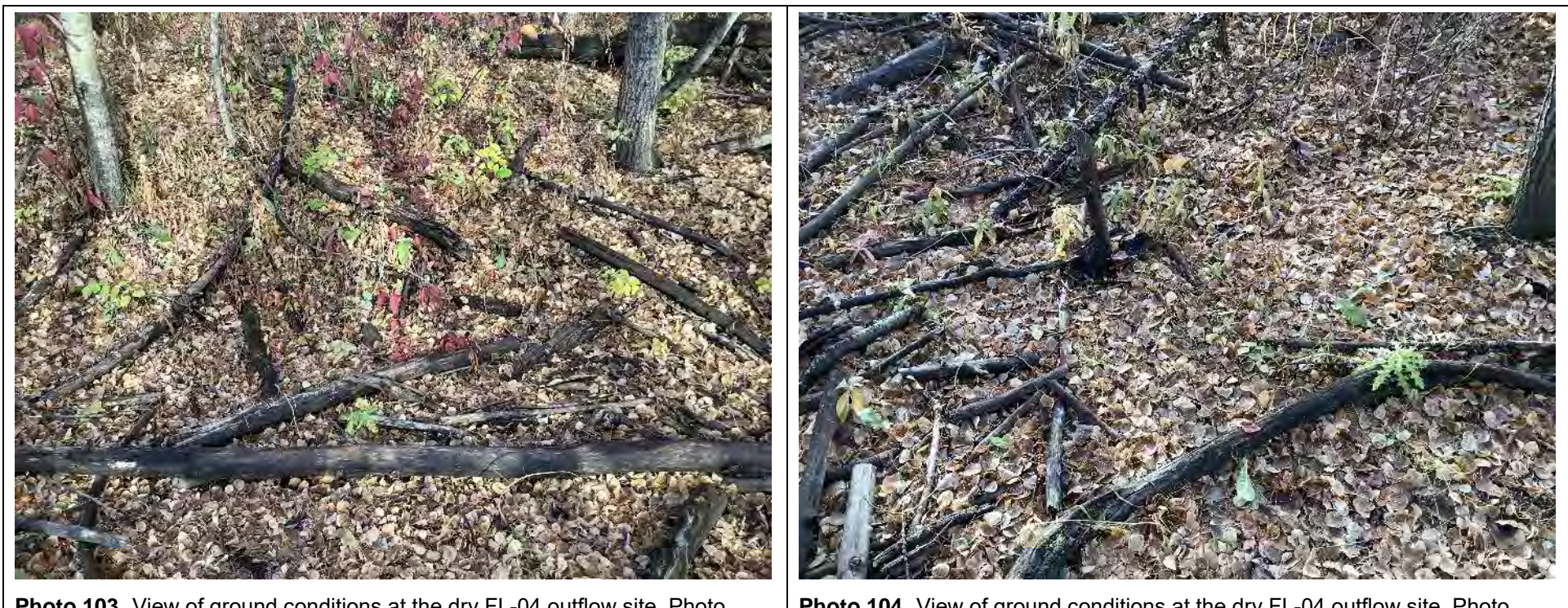
Photo 103 View of ground conditions at the dry FL-04 outflow site. Photo taken during fall sampling on October 15, 2020.