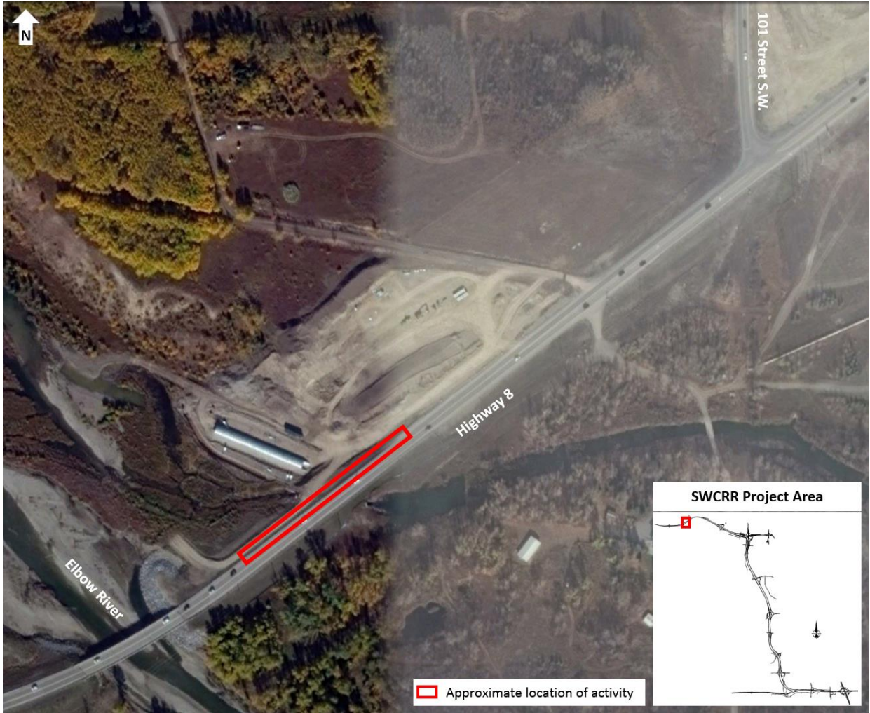
SWCRR Project Area